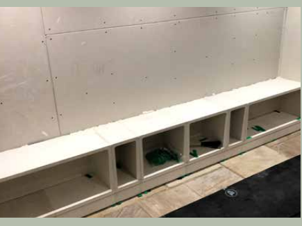
4. First row of modules are laid on top of the plinth