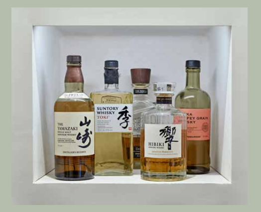
Bins allow for vertical bottle storage