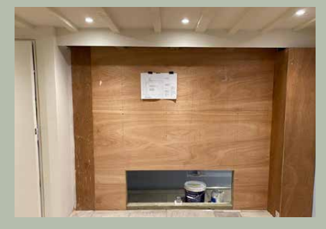
1. Room clad in plywood

Once completed, the Spiral Cellars install team were back on site where it took just under 2 weeks to fully install the UnSpiral Cellar.