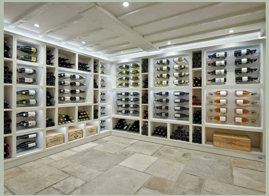
9. The finished room