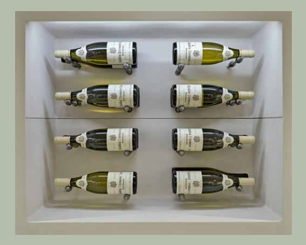
16 bottle display with LED