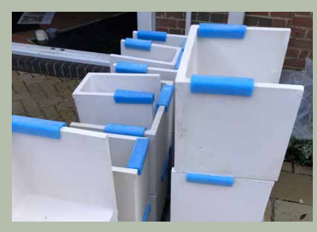
2. Modules arrive on site and are unwrapped