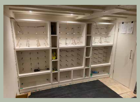
6. Lighting integrated as building progresses