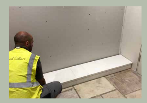
3. Floor plinth laid along dominant wall