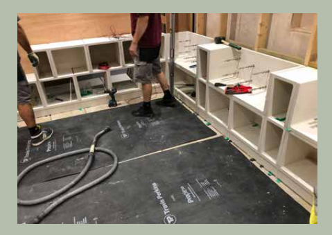
5. Modules are laid sequentially row by row