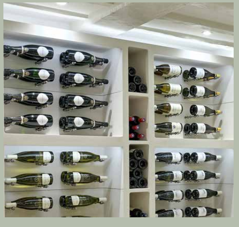
Pelmet-edge lighting creates a feeling of space