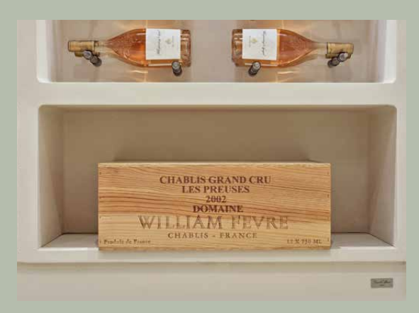
Double bin for case-on-side storage