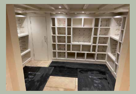
7. Build complete and ready for finishing works