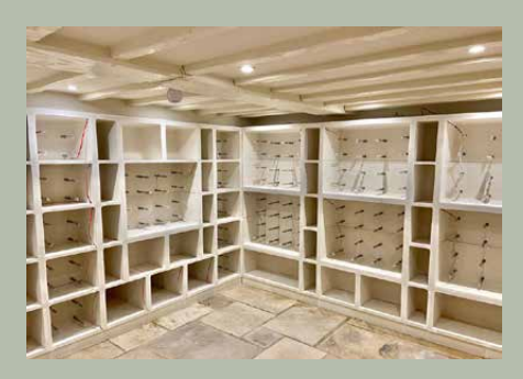
8. Awaiting final fix electricals