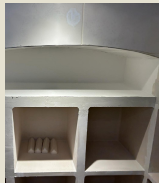
5. Finishing works undertaken