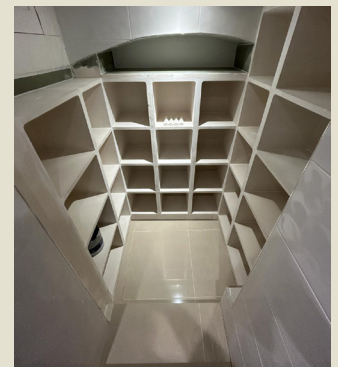
6. Ready to be filled with wine