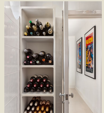
9. Finished column stack

To find out more about our products and services, please visit our website or contact our Customer Adviser team.