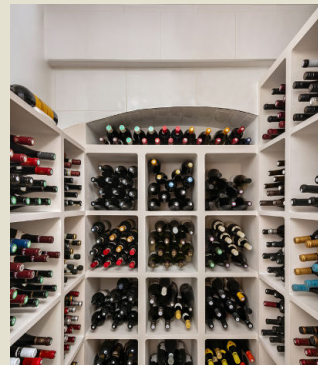
8. Finished wine room