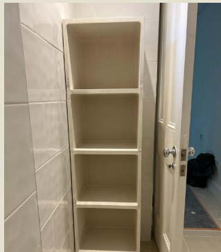
7. Single column stack ready to be filled with wine