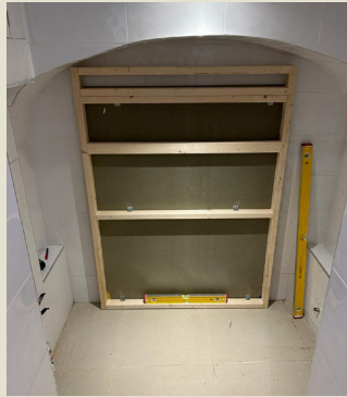
1. Modules stacked row by row