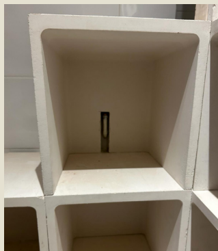
4. Pre-cast modules delivered to site