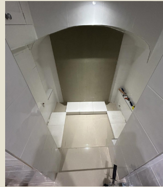
2. Preparation of back wall