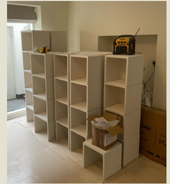
3. Back wall prepared ready for modules to be stacked